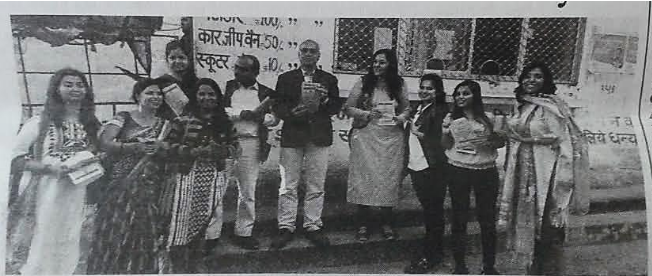
Doon University's School of Management's students and faculties were seen making an appeal to the travellers with note "all the travellers are requested not to throw bottles of mineral water, cold drinks, cane, polythene and plastic material on road. please help to save environment" under the banner of make india clean and Make India developed at Kuthal Gate on way to Mussorie on Friday